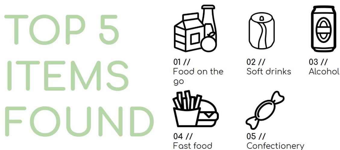
Fig 2: Most prevalent types of litter in Petersfield, Nov 18, based on site reports from all volunteers

Six full black sacks of litter were collected on the morning of Sunday 11th in the town centre - an area which had been cleared during the previous week by volunteers and is continuously monitored by EHDC contractor Id Verde - indicating how quickly litter is generated. The volunteer who cleared the Watermeadows and Tesco path was dismayed that just a week later it seemed as littered as before. A small incident of fly-tipping in the Festival Hall car park was cleared at our request, and another volunteer self-cleared other minor fly tipping near the Rival Moor playground.